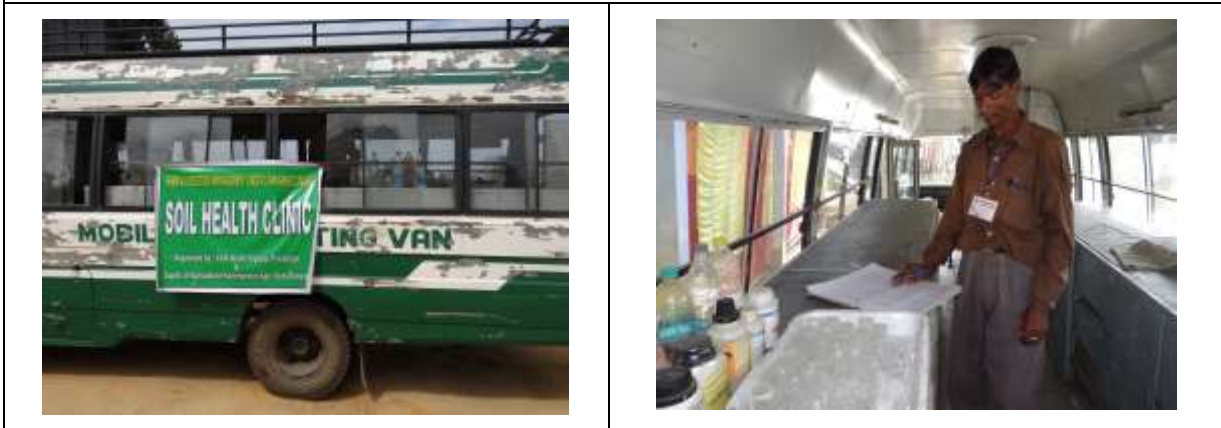
Soil Health Clinic- 128 soil samples were tested.