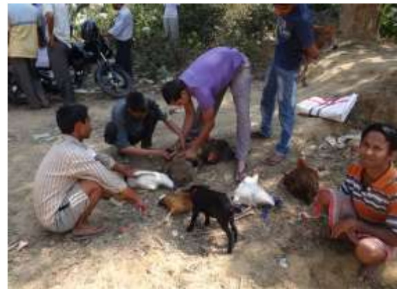
Animal Health Clinic- 175 cattle, 350 poultry birds, 65 goats, 18 pigs, 16 dogs either vaccinated or treated in the camp.