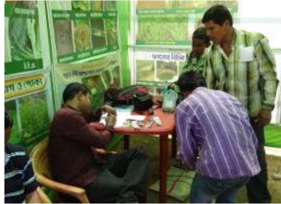
Plant Health Clinic- 75 farmers took advise from the experts