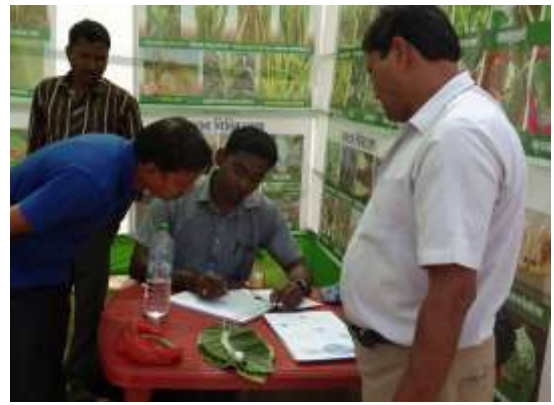
Fish Health Clinic: 45 farmers brought their fishes for diagnosis & prescription.