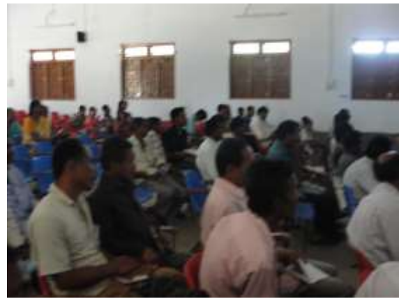
Climate Field School- Six Climate Field School has been formed. AAS Unit, Lembucherra will develop direct link to the school through KVK North Tripura and Chief Volunteer of each school.